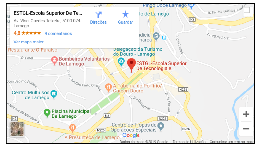
MARCH 21-22, 2019 IN LAMEGO, PORTUGAL